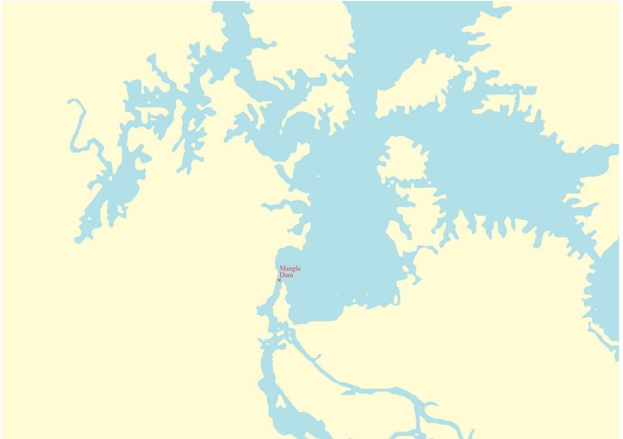
Map of Mangla Dam, located on the Jhelum River in the Mirpur District of Azad Kashmir, Pakistan.