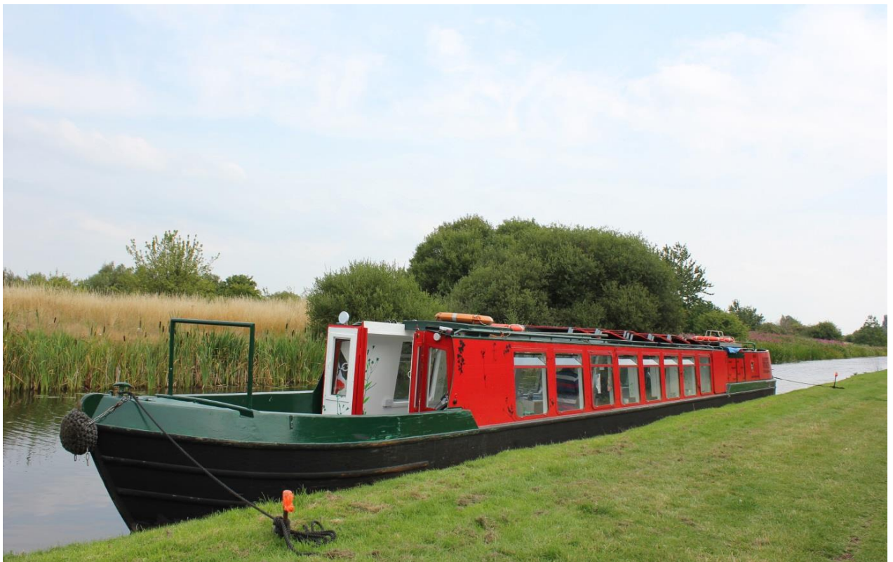
Black Country Voyages